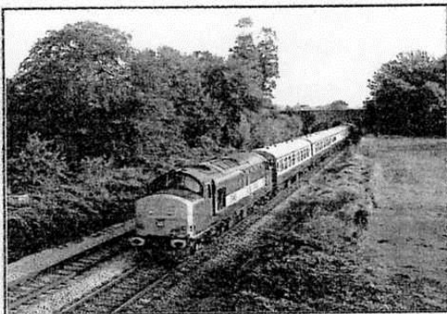
'The Eden and Penzance Explorer' passing through Sherborne at 08.40 on Saturday 30th. September 2006.