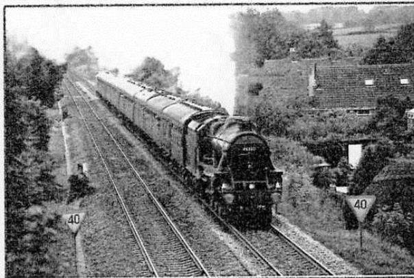
Black Five No.45231 passing through Bradford Abbas on the 11th. October 2006 with Steam Dreams 'Cathedrals Express' from Minehead to Salisbury