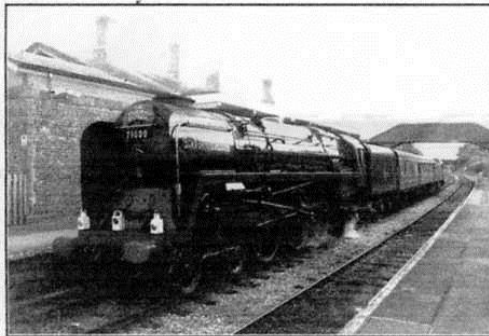
71000 Duke of Gloucester at Maiden Newton 9th. July. 2005

The first 'Sunny South Special' of the summer from London to Weymouth run by Steam Dreams scheduled for the 29th. June had to be cancelled due to a weak bridge near Maiden Newton. The train was intended to be hauled by 71000 Duke of Gloucester recently returned to the main line following repairs to its boiler. The weak bridge prevented the running of the locomotive from Weymouth to Yeovil Junction and back for servicing. It is not clear whether this situation will be resolved prior to the running of King Edward I to Weymouth in conjunction with the Pen Mill 150 event on the 29th. July.