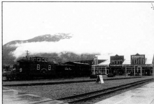
Caboose and Rotary Steam Snowplough No. 1 on display outside of the railway station at Skagway in Alaska on the 15th. June 2006.