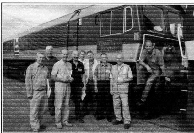
Some of the Yeovil Railway Society members who helped on the day.

Our thanks go to all our members (and their wives) who gave up their time, not only on the day, but during the lead up to the event to make it a really enjoyable time.