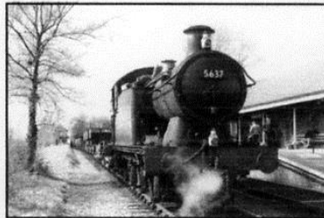
56XX No.5637 arriving at Cranmore with a freight from Mendip Vale. 1st.April 2006.

Not to be upstaged by the West Somerset, the East Somerset Railway at Cranmore also held their 'Spring into Steam' gala over the first weekend of April. Although not on the same scale, it was nevertheless enjoyable, with the resident loco's 56XX No.5637, USA No.30075 and Andrew Barclay 0-4-0T's No.705 and No.1398 'Lord Fisher'.