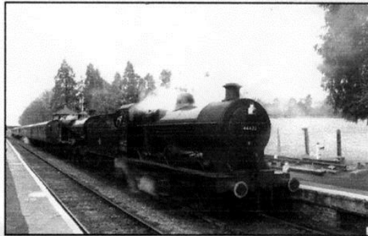
S&D '4F' No.44422 and '7F' No.53809 at Crowcombe on the 24th.March with the 16.55 from Bishops Lydeard (Templecombe) to Minehead (Bournemouth West).

Despite the weather large crowds flocked to the West Somerset Railway on both long weekends from 18/19 and 23-26 March for the much publicised S&D Gala. With nine engines in steam representing many of the classes that worked over the S&D during its lifetime, all helping to rekindle the nostalgia associated with the unique line.